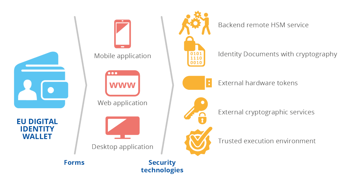
Figure 4: European Digital Identity Wallet forma and security technologies